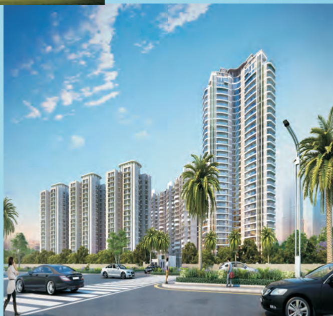
Group Housing Delivered Sec-79