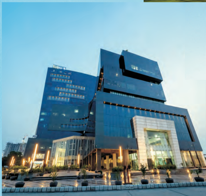
NPX Delivered Sec-153