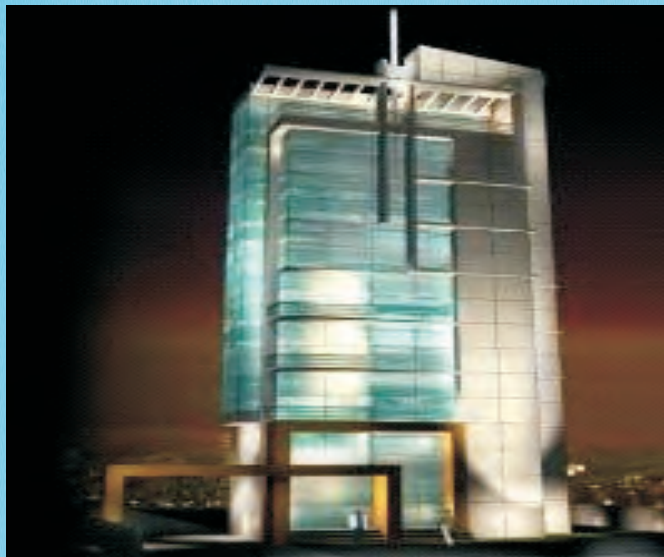
Intellect Delivered Sec-125