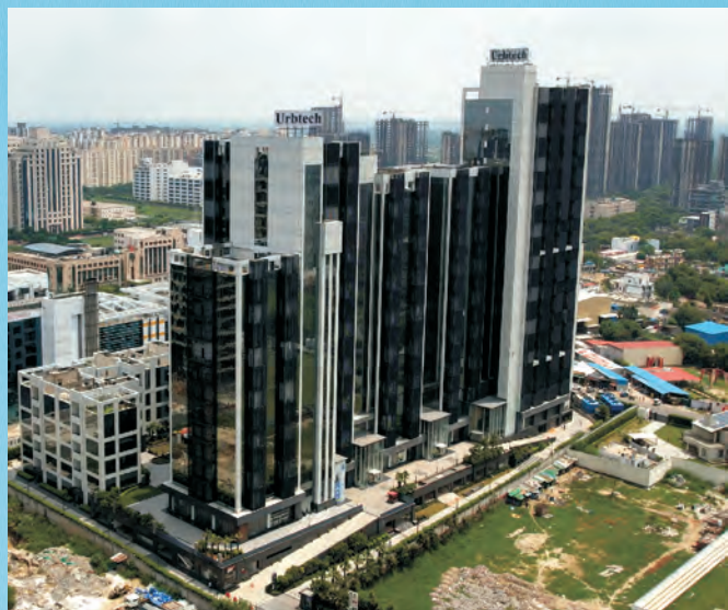
UTC Delivered Sec-132