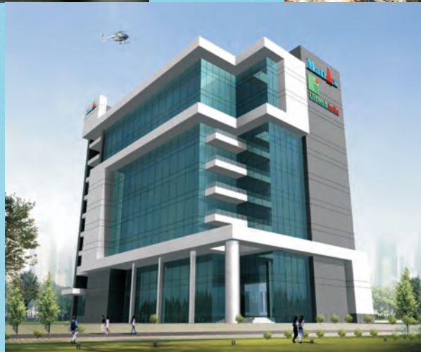
Matrix Delivered Sec-132